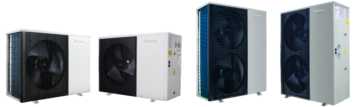
CGK025V3L-B CGK030V3L-B CGK040V3L-B CGK050V3L-B CGK060V3L-B CGK-025V3L-B CGK-030V3L-B CGK-040V3L-B CGK-050V3L-B CGK-060V3L-B